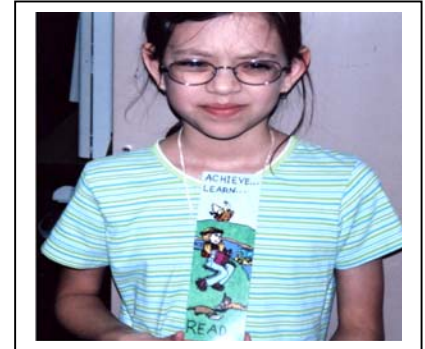
City of Angels-Sherman Oaks